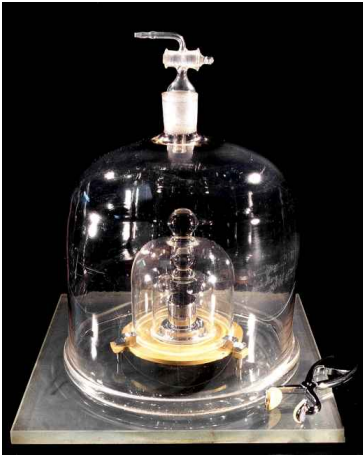
Fig. 3 The Kilogram prototype