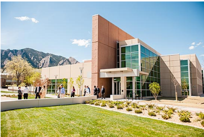
This is NIST: Precision Measurements Lab.